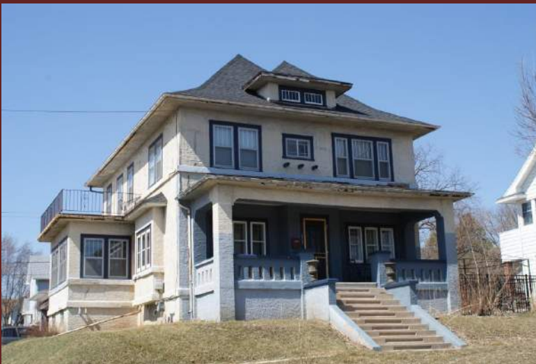
John Streiff House, 619 2 nd Street, c.1919