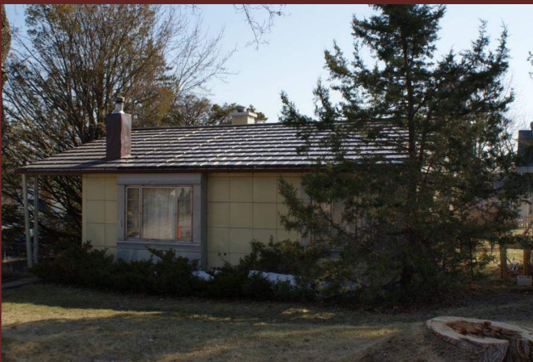
419 8 th Avenue