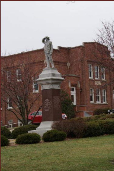
Pioneer Monument, 1915

Also included on the church site are the following: