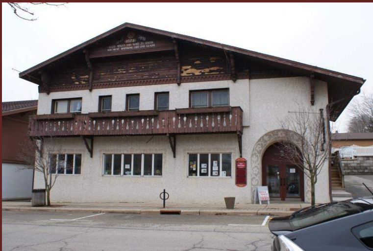
Hoesly & Hoesly Block, 109 5 th Avenue, 1914, Swiss Façade: 1978