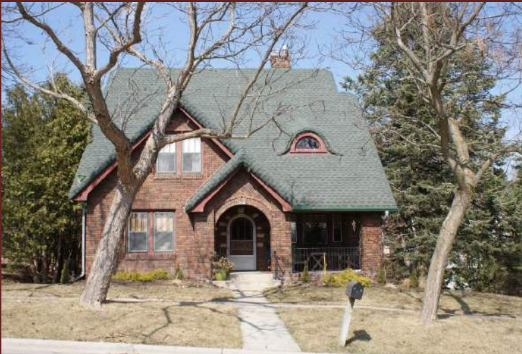
Elmer Figi House, 312 2 nd Avenue, 1928, Builder: Oswald Altman

Unusual Regency Revival style based on English architecture of the early 1800s.