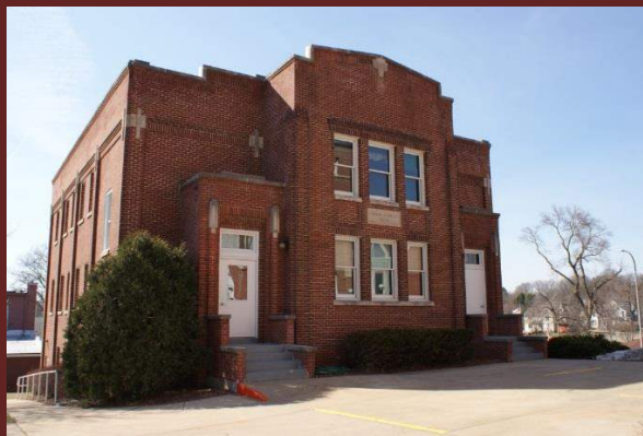
Zwingli House, 1924, Tudor Revival influenced