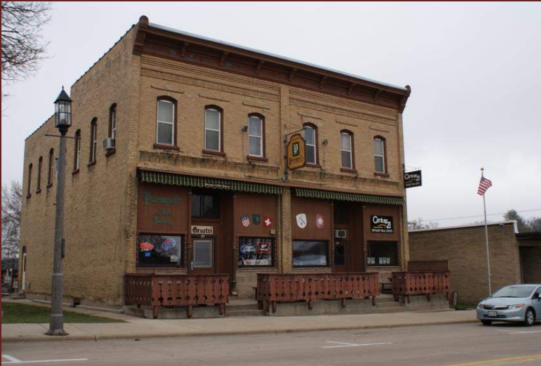
Puempel's Tavern, 16-18 6 th Avenue, 1893