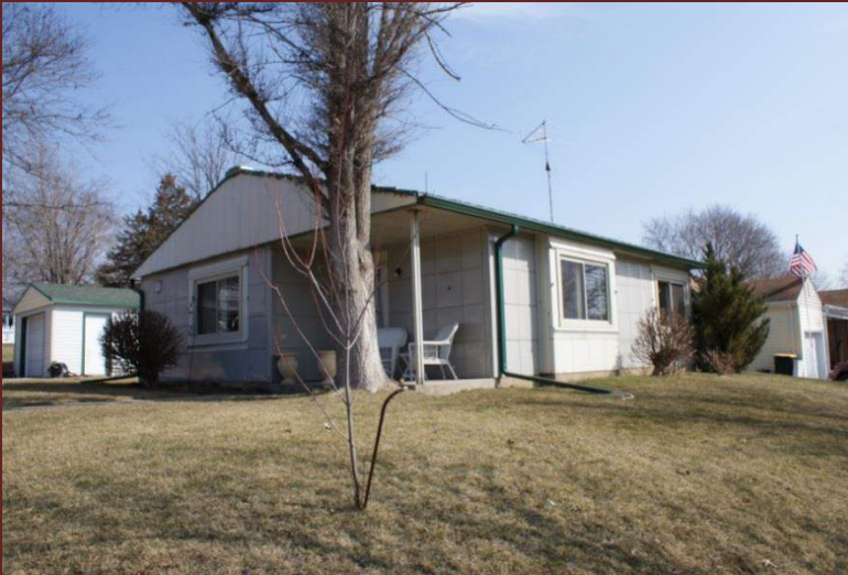
318 11 th Avenue

These two houses are small examples of the Ranch style, but are unusual for their building materials; enameled steel panels. Known as Lustron Houses, both were built around 1949.