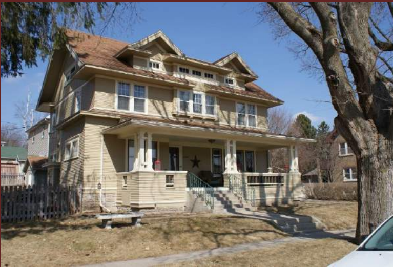
Swiss Reformed Church Parsonage, 300 3 rd Avenue, 1914, Builder: Oswald Altman