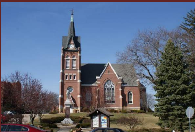
Swiss Evangelical and Reformed Church, 18 5 th Avenue, 1900