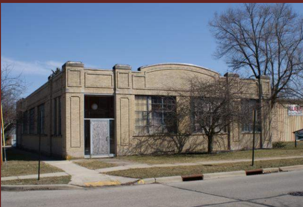
Upright Swiss Embroidery Factory, 1100 2 nd Street, 1924