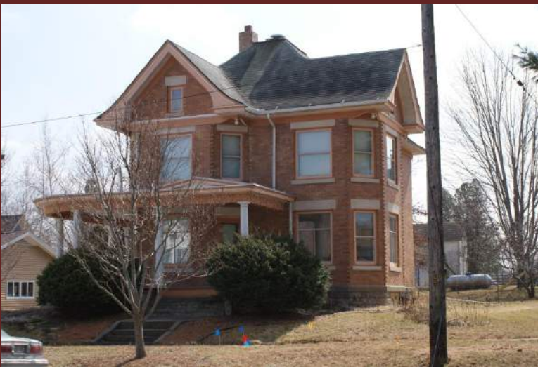
Henry Marty House, 113 8 th Avenue, 1913