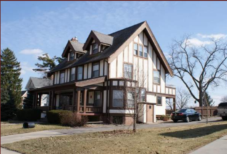
S. Albert Schindler House, 513 6 th Avenue, 1911 This house has a bay, half-timbering, and a form that suggests the Tudor Revival Style.