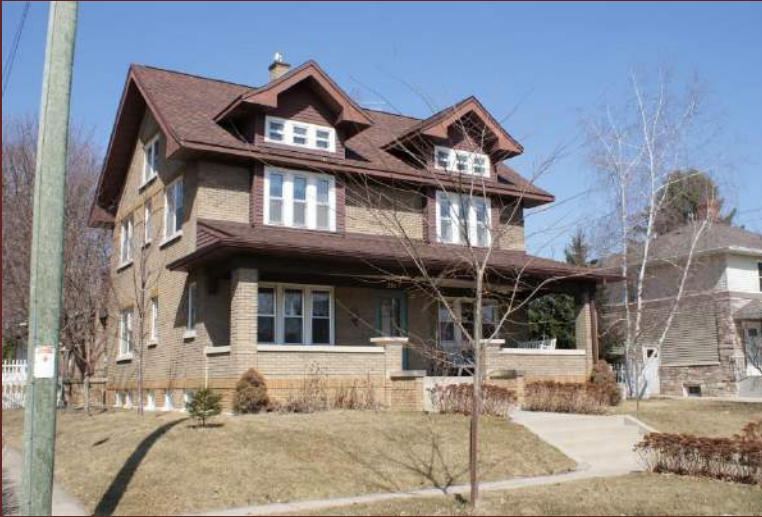
John Zweifel House, 218 3 rd Avenue, 1922