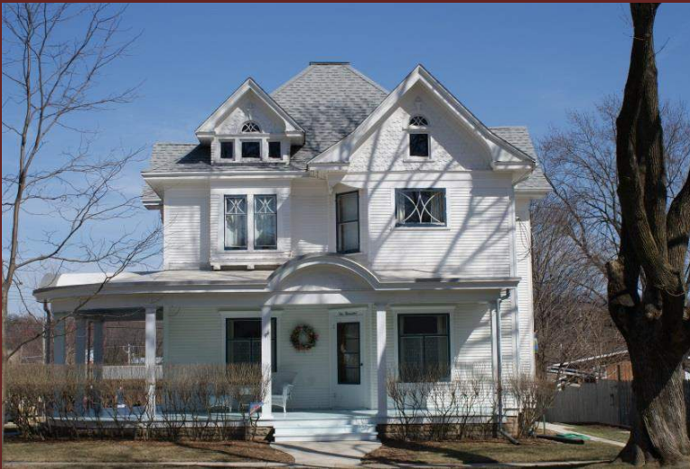
Sam Duerst House, 1000 1 st Street, 1915, Builder: Oswald Altman An fine wood-clad example of the Queen Anne style.