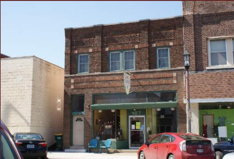
Stuessy Block, 407 2 nd Street, 1929