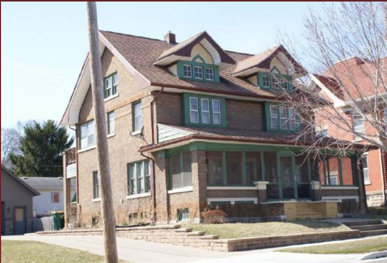
Dietrich Stauffacher House, 707 1 st St., 1919