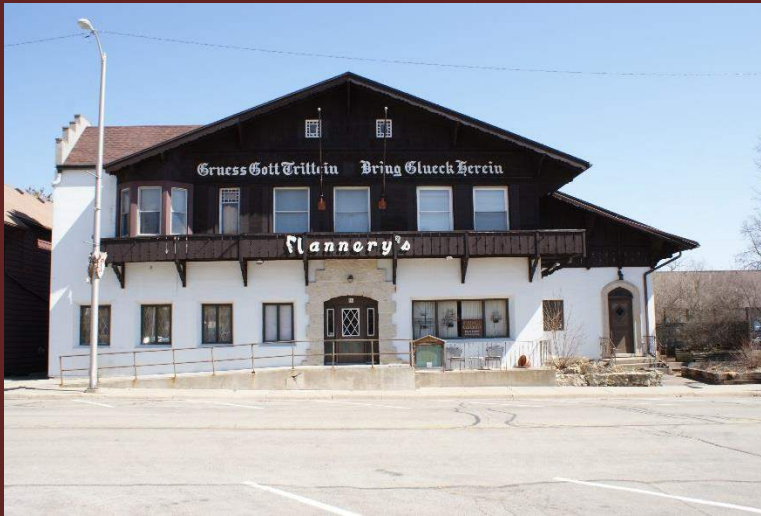
Old Wilhelm Tell Hotel, 114 2 nd Street, 1900, Swiss Façade: 1964