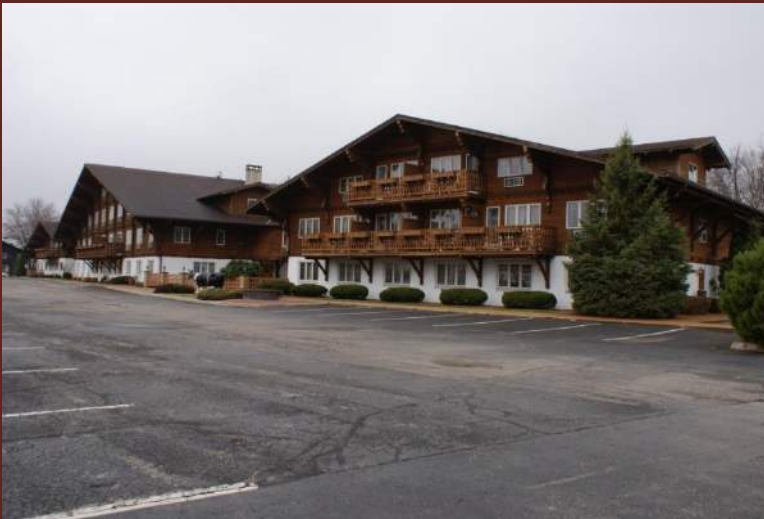
Chalet Landhaus Inn, 801 Highway 69, 1980