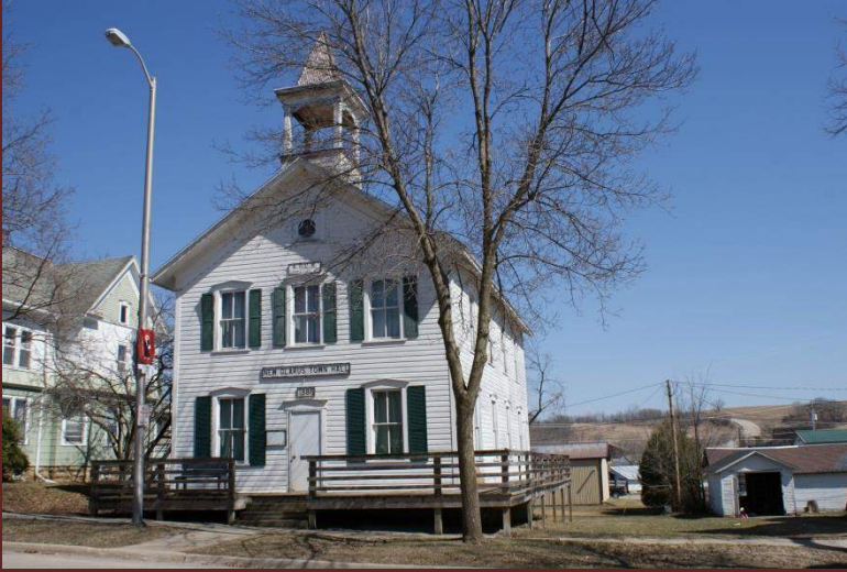
New Glarus Town Hall, 206 2 nd Street, 1886; Listed 2008