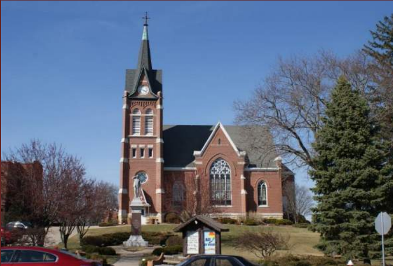
Swiss Evangelical and Reformed Church, 18 5 th Avenue, 1900

Also included on the church site are the following: