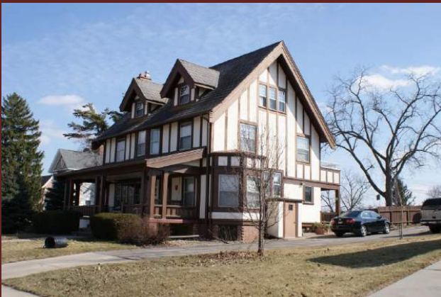
S. Albert Schindler House, 513 6 th Avenue, 1911