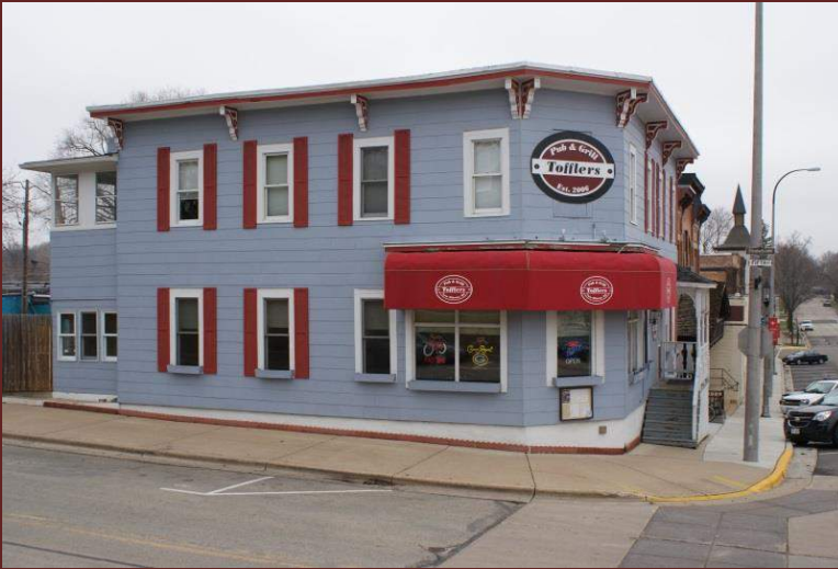
Hoesly Block, 200 5 th Avenue, c.1880