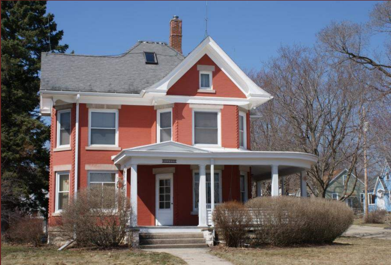
Albert Wittwer House, 1101 2 nd Street, 1912, Builder: Oswald Altman

The following houses are mirror images of each other.