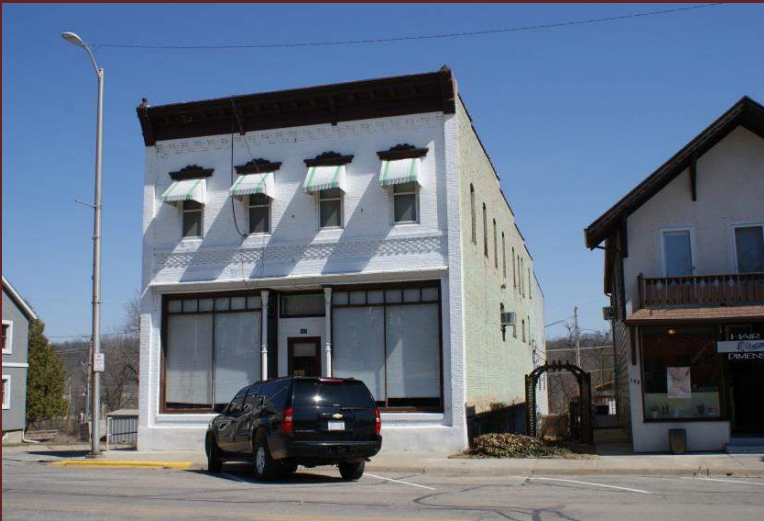
Thomas Hoesly Block, 102 2 nd Street, 1891