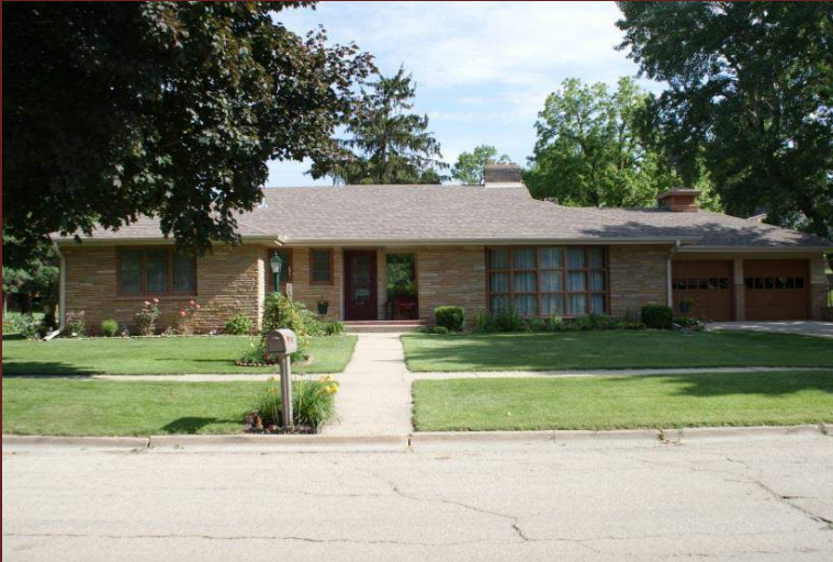
Edwin Christen House, 418 3 rd Avenue, 1949