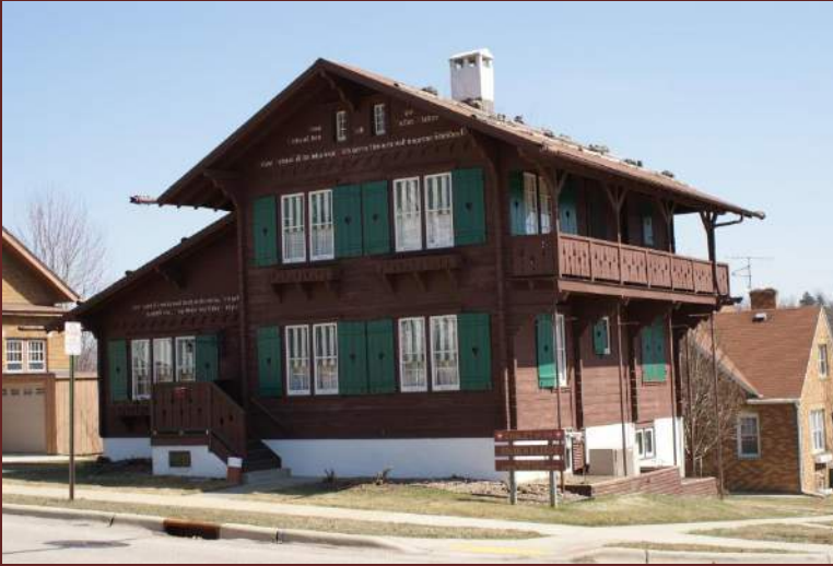
Chalet of the Golden Fleece, 618 2 nd Street, 1937-38 Chalet based on authentic Bernese architecture.