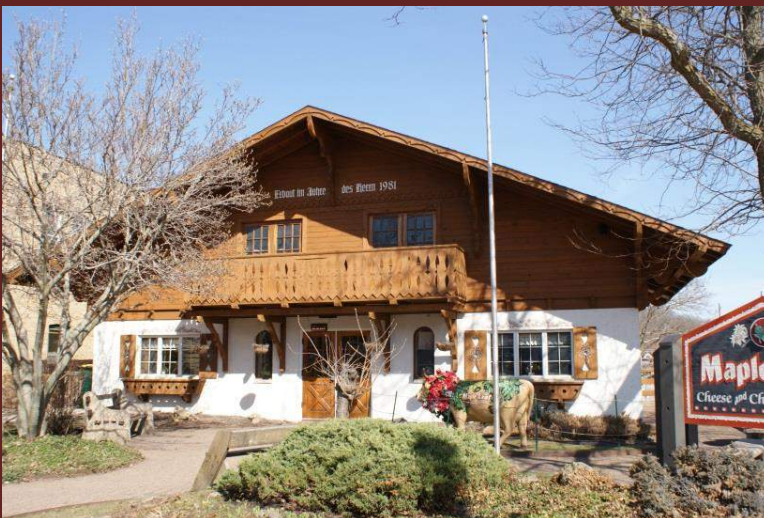
Retail Building (Old Gas Station), 554 1 st Street, remodeled: 1981