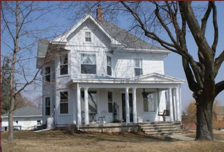
Casper Zwickey House, 600 9 th Avenue, 1909, Builder: James Gross