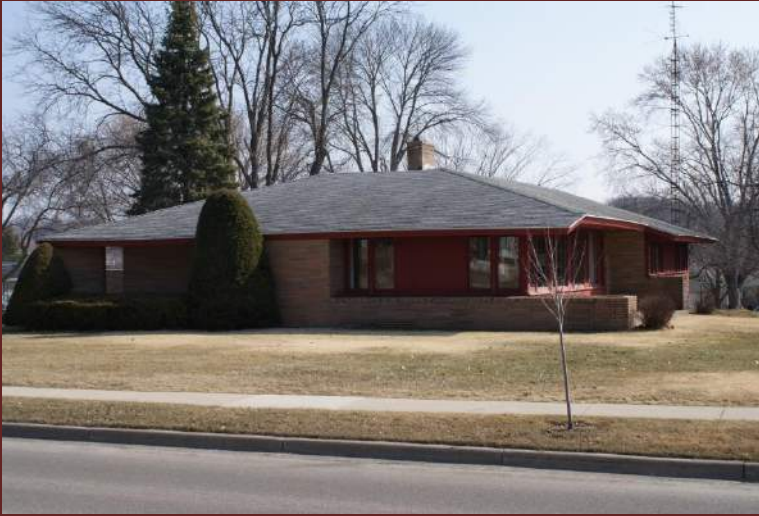
Ranch House, 318 11 th Avenue