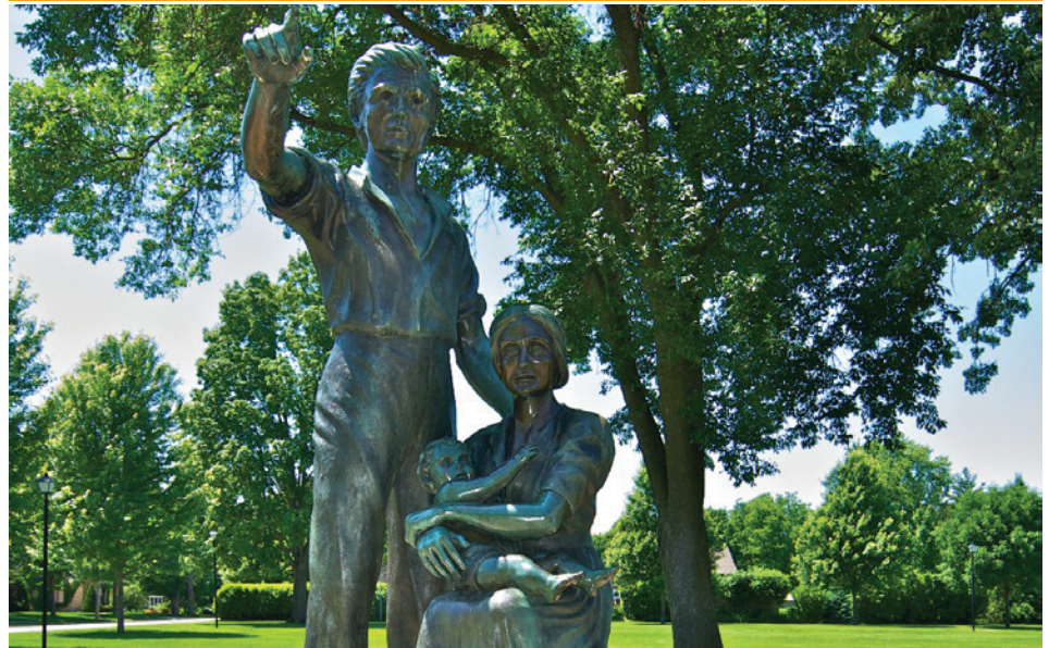
The Pioneers, a sculpture by local artists Clarence Shaler, was donated to the city in 1940.

The employees at the utility are passionate about the work they do and maintain a positive attitude, even when faced with new challenges. In 2013, WU