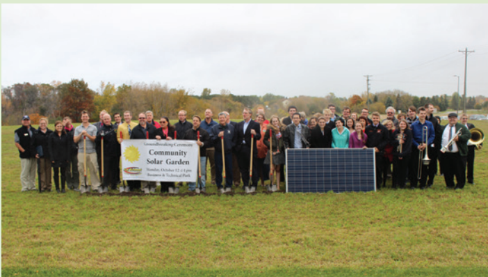
New Richmond residents gather for a groundbreaking ceremony featuring entertainment from a choir and brass band