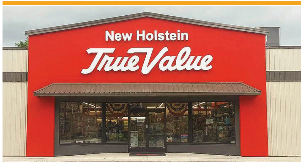
New Holstein True Value will save an estimated $3,000 per year after updating to LED T8 tube lighting.

of electricity annually, for an estimated cost savings of about $14,000 per year. Plymouth Utilities, through WPPI Energy's Utility and Municipal Building Efficiency program, is providing financial assistance, as is the state's Focus on Energy program.