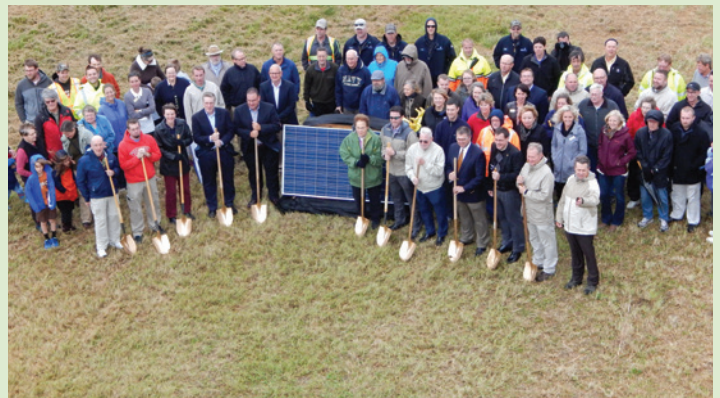
River Falls residents break ground on the city's community solar garden