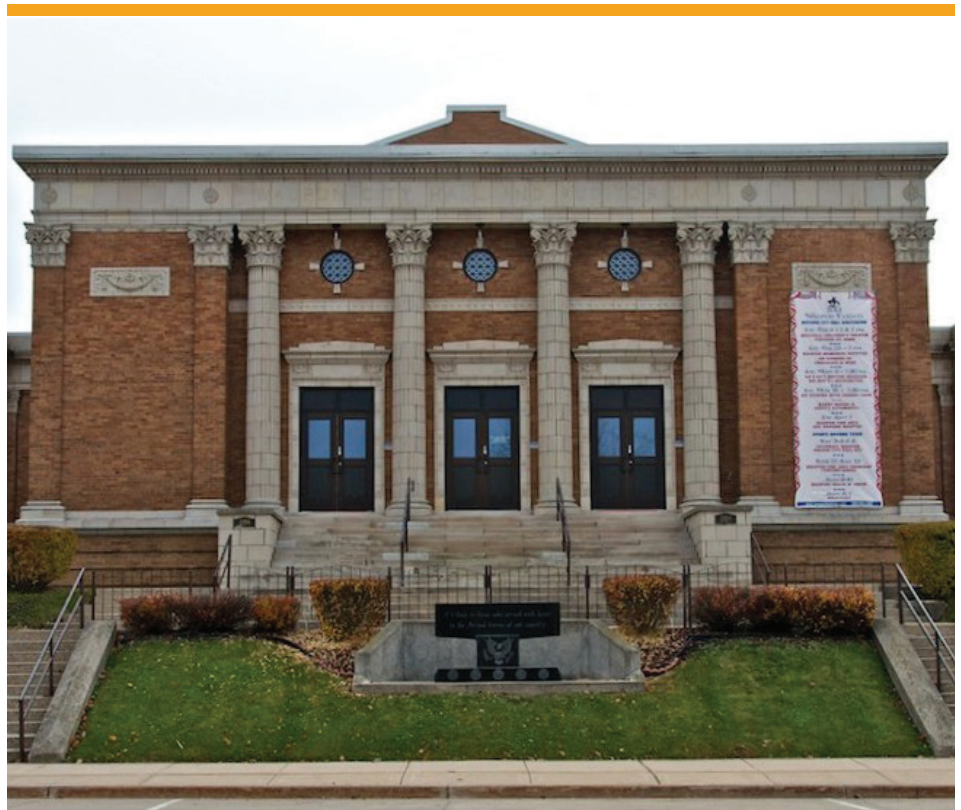
Waupun's City Hall.

"We want to see the community succeed, and I think a strong utility is the foundation of the success of the community," says Posthuma.