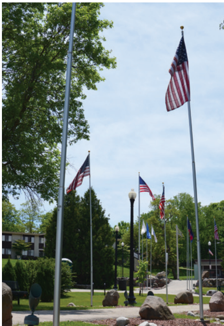
The city of Plymouth plans to upgrade 600 city street lights to LEDs by the end of 2017.

Many WPPI Energy members have helped upgrade some or all of their community's street lights to LEDs. One of these members is Plymouth Utilities, which is currently in the middle of an LED street lighting project. City officials plan to replace 600 100-watt HPS heads with 45-watt LED heads over a three year period (2015-2017). The upgrade is estimated to save the city approximately 221,900 kilowatt-hours (kWh)