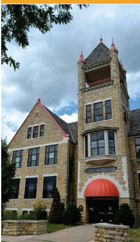
The historic Rock School, with its Romanesque revival architecture, is a school building for kindergarten and first grade.