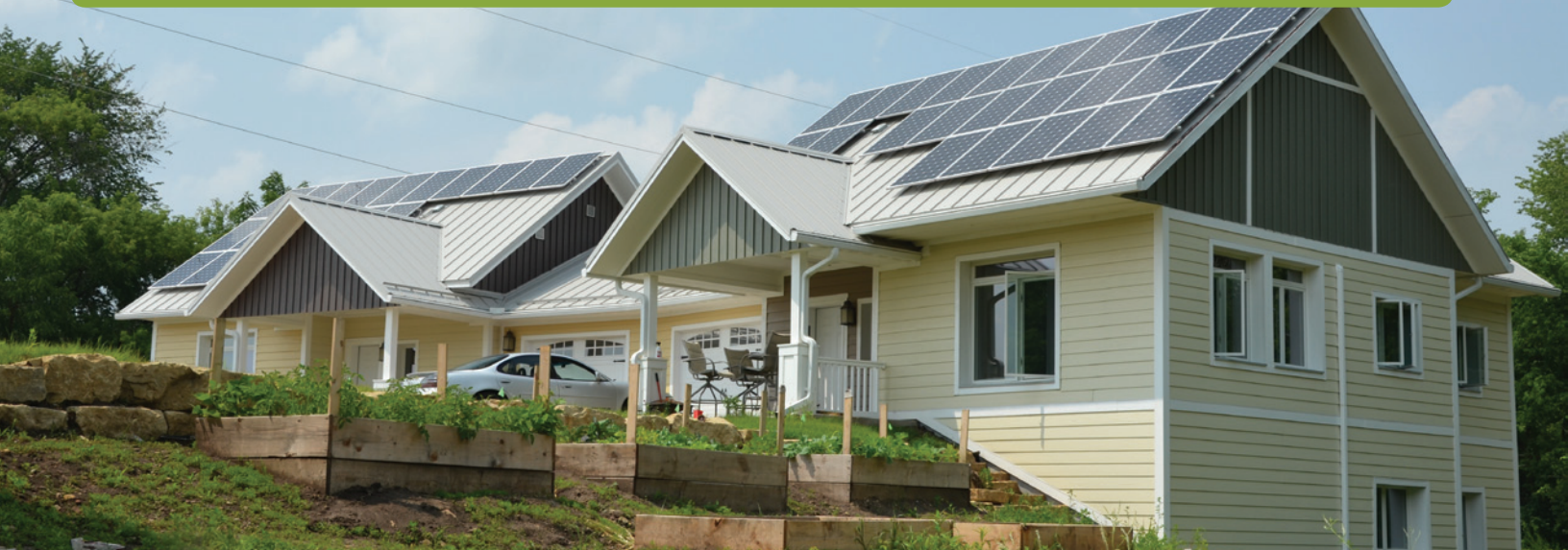
The River Falls EcoVillage, a St. Croix Valley Habitat for Humanity community, is designed to be net-zero energy use, with LEED Platinum and ENERGY STAR® certifications.