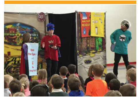
A student holds a banner that reads "Open Your Eyes: Be Energy Wise!" during a National Theatre for Children performance on Feb. 16 at Clovis Grove Elementary School in Menasha, Wis.

During the 25-minute show, students learn that the evil Dragonfly is encour-