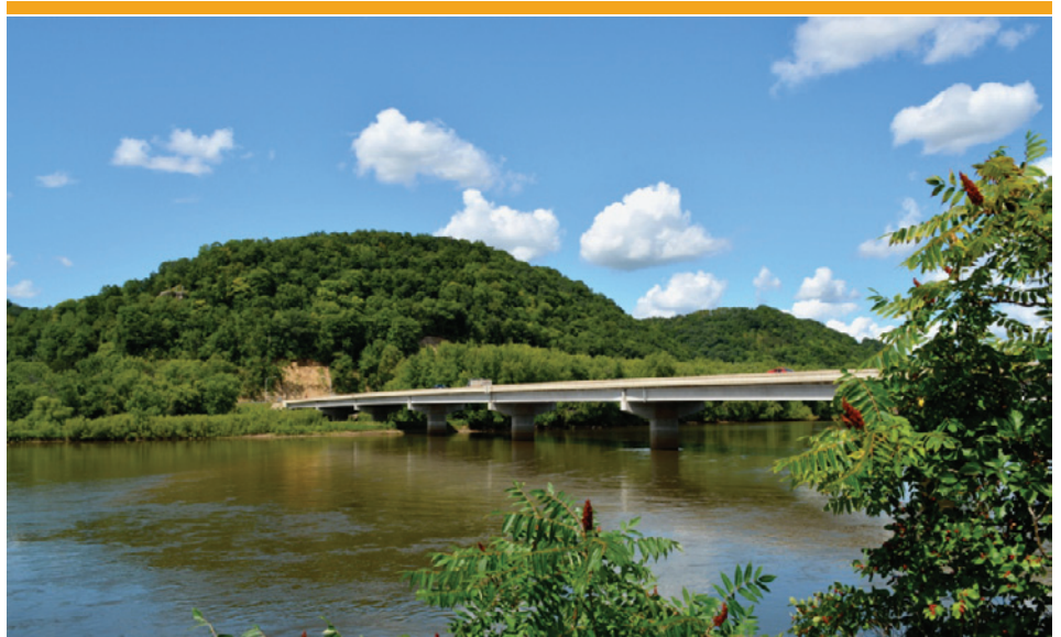
U.S. Highway 61 crosses the Lower Wisconsin River via the Boscobel Bridge. The bridge is dedicated to one of the city's well-known residents, former Wisconsin Gov. John Blaine.

Each August, history comes to life when hundreds of people arrive for the Muskets and Memories Civil War Reenactment and G.A.R. Heritage Encampment. Popular battles of the North and South are recreated, along with social events, band concerts and other activities.