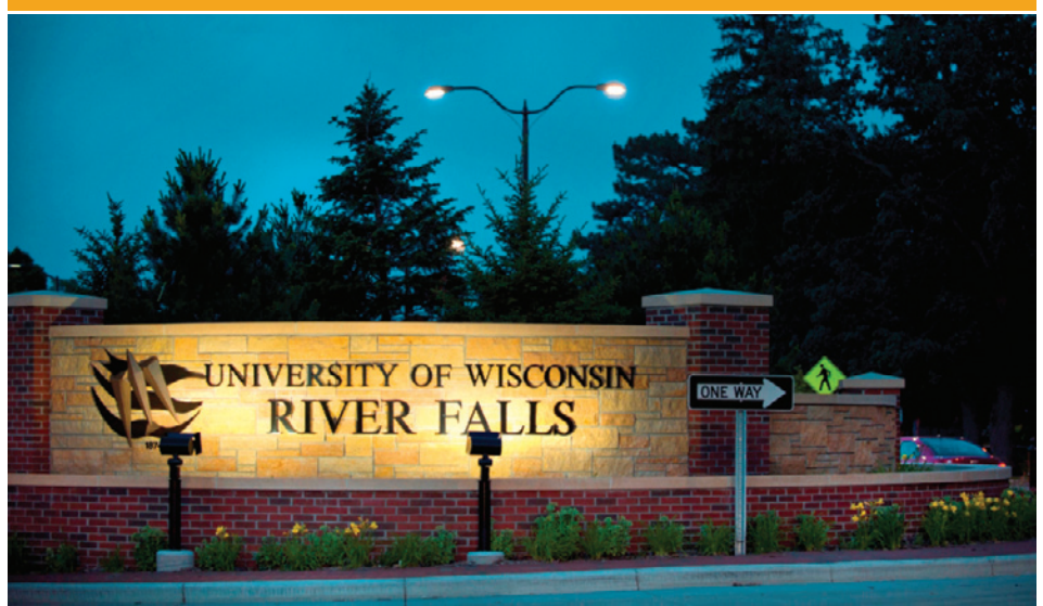
Thanks to the support of UW-River Falls students, the University Center and all residence halls on campus are powered by renewable energy through the Green Power for Business program offered by River Falls Municipal Utilities.

The U.S. Energy Information Administration predicts that in 2014, renew-