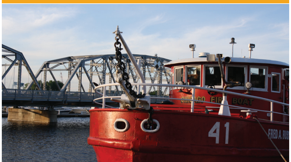
A historic fire boat is on display near the Michigan Street Bridge.

A sign at Sawyer Park and special flags proclaim Sturgeon Bay the nation's 15th Coast Guard City. The city is home to