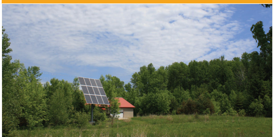
Crossroads at Big Creek, an educational center in Sturgeon Bay, installed a solar array and collector with technical support from the utility.

In recent years, SBU has focused on building a new substation and installing